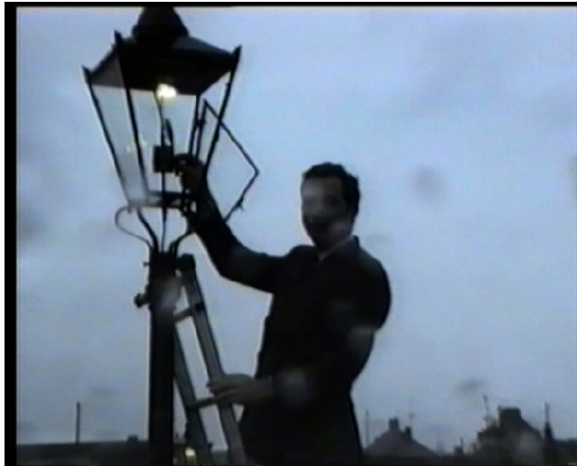
Figure 4. VHS video still, Shalom Park, 28 April 1989.

Evening Echo was a project that developed over three years between 2008 and 2011 and the short residency programme I initially undertook with the National Sculpture Factory has become a sustained relationship with people and place. Cork City Council and I have a Promissory Agreement that contains an attempt to bind us into a relationship for the long-term future through a clause stating: All parties acknowledge that it is the artist's intention for Evening Echo to exist in perpetuity. In some ways the document is there as a form of guardianship, a conceptual attempt on my part to safe-guard against the process of forgetting that many public art works are immediately susceptible to—one that Evening Echo attempts to resist but is perhaps especially vulnerable to given its literal 'lightness' of presence.