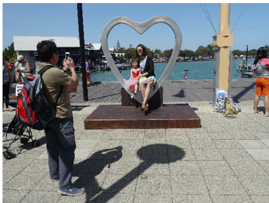
Figure 6-7. Mandurah, 2014.