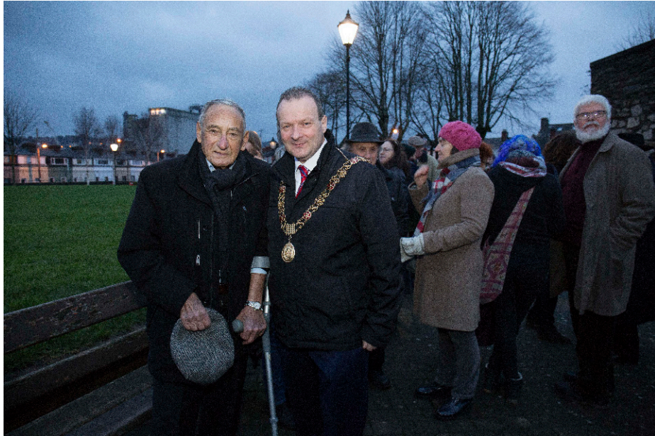
Figure 2. Shalom Park, Cork, 2015.

Nine lamps form a perimeter adjacent to the path that circles the park. For 364 days a year, eight of these lamps illuminate each night as lux levels drop and Cork’s network of street lights ignite. However, one light in the park does not. To the observant eye the lamp that does not fire is also taller than its eight companions. However, on this day , at ten minutes before sunset (or when ‘there are three stars in the sky’ 2 ) the tall lamp ignites. Solitarily it glows green, then slowly brightens to clear white as daylight in the park fades. After a while, one or two or three of the other lamps fire at random—it depends on their sensors. When all lamps are alight, they burn together for 30 minutes. People walk about, stop and talk, sit on the park benches, take photographs and start to leave. Then the tall lamp, the lamp that came on first, suddenly extinguishes. People aren’t watching at that point and the moment is missed by most. This is the process that will occur for the eighth time in December this year.