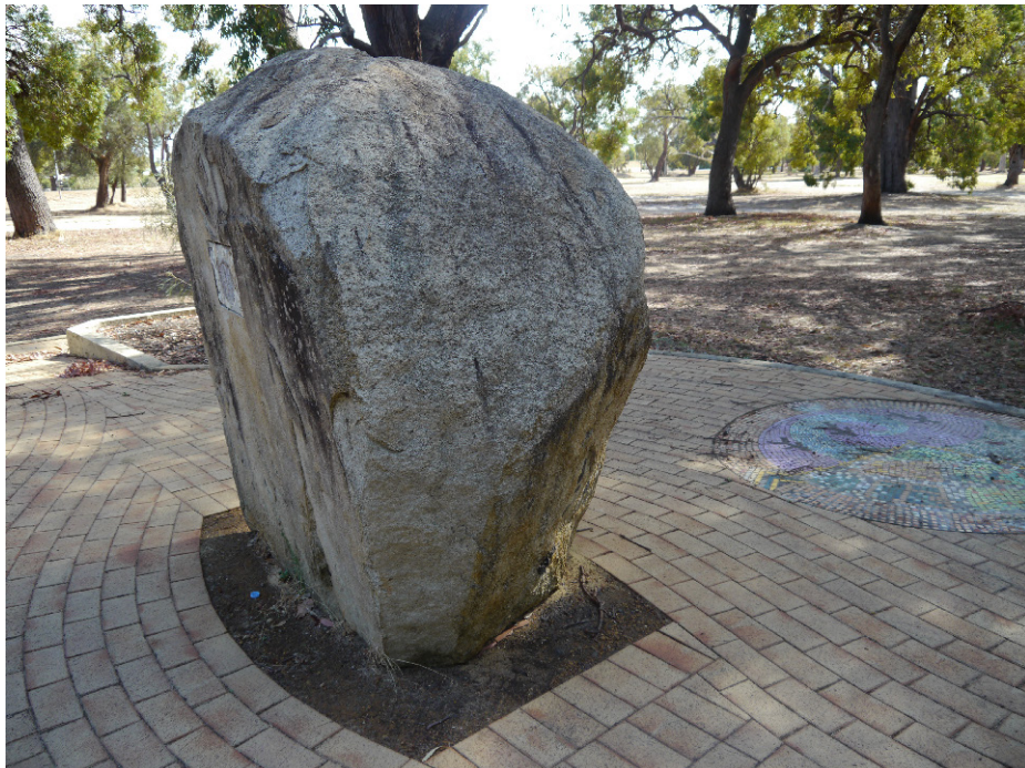
Figure 8. Mandurah, 2014.