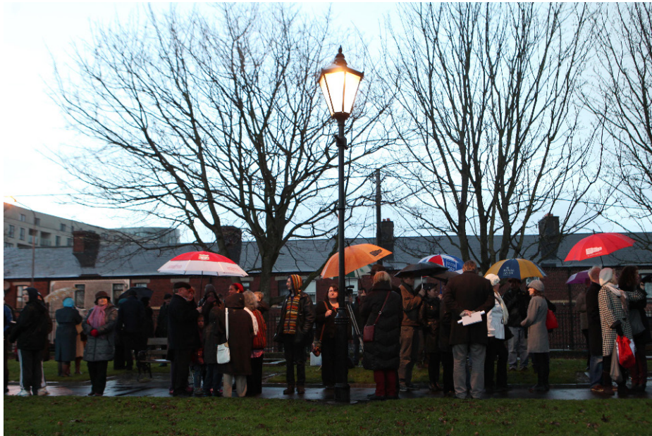
Figure 1. Shalom Park, Cork, 2012.