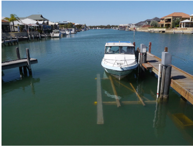
Figure 5. Mandurah, 2014.